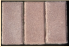
Pavers after cleaning.

Completely eliminating the chance of efflorescence, however, isn't possible because it's a natural byproduct of hardened concrete. It will stop when no more calcium hydroxide is available to move to the surface.